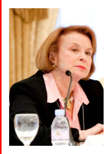
Senator Harriette Chandler:

"For every one person who lacks medical insurance, three lack dental insurance.... True health care reform must ensure the health of the whole body.... Body part by body part, that is not the way to do health care."